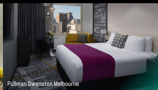
Pullman Swanston Melbourne

Located a quick tram ride from Melbourne's city centre, the MCG is easily accessible to a collection of world class hotels and apartments. AFL Event Office has a selection of quality accommodation options available, to help you plan a Grand Final weekend to remember. Book with confidence with our comprehensive COVID-19 policy. To find out more, visit www.afl.com.au/eventoffice or call our experienced team: 1300 235 235 (within Australia).